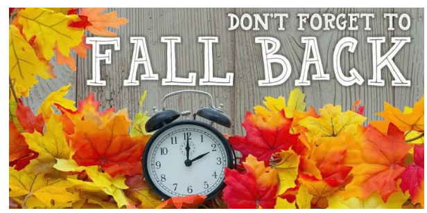
November 6th, so turn your clocks back Saturday night.

Reminder that the first Sunday of every month communion will be offered.